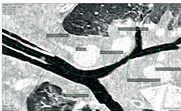
Fig. 3. Chest computed tomography after surgical repair. The constriction of the left bronchus can be seen at the surgical site

Coma Scale score was 7, and bag ventilation was in progress. Chest examination revealed bilateral crepitus, muffled heart sounds, and massive subcutaneous emphysema of the chest, neck, and head; this precluded assessment of the trachea and neck veins. Other injuries included pelvic, femoral, and ulnar fractures. Due to hemodynamic instability, fluid resuscitation was continued and catecholamine infusion was started. Bilateral needle pleurocentesis was immediately performed without significant air outflow. Total body computed tomography (CT) revealed multiple rib fractures, a bilateral pneumothorax, tension pneumopericardium with a 35-mm air layer, and pneumomediastinum with extensive subcutaneous emphysema (Fig. 1). Additionally, rupture of the left main bronchus was suspected. Emergent pericardial needle aspiration (about 90 ml of air and bilateral pleural drainage) resulted in circulatory stabilization. Repeat chest CT revealed reduction of gas space in the pericardium to 12 mm without a tension effect and with gradual lung expansion. The patient was then transferred to the intensive care unit.